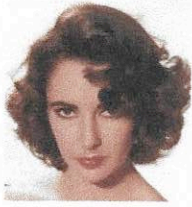
Elizabeth Taylor, Actress (2/27/1932 – 3/23/2011) 1950

Elizabeth Rosemond "Liz" Taylor attended school at MGM and received her high school diploma from University High School in 1950. She is one of the most important and celebrated actresses of the past 50 years. Her first film was National Velvet in 1944. For the next three decades she starred in film classics such as Suddenly Last Summer , Giant , Father of the Bride , A Place in the Sun and Cat on a Hot Tin Roof . She won an Academy Award for Best Actress for Butterfield 8 in 1960. She then played the title role in Cleopatra in 1963. In 1966, she won an Academy Award for Best Actress for Who's Afraid of Virginia Woolf .