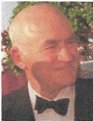
Peter Viertel, Author and Screenwriter (11/16/1920 – 11/4/2007)

Elizabeth Taylor was a strong supporter of HIV-AIDS research and founded American Foundation for AIDs Research in 1985 and the Elizabeth AIDs Research Foundation in 1991. For her humanitarian work, she has received the Presidential Citizens Medal, and the Jean Hersholt Humanitarian Award. She also received a Lifetime Achievement Award from the American Film Institute that also named her number seven on its list of Screen Legends.