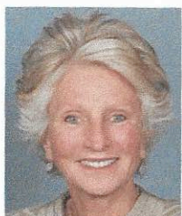
Jane Harman, U.S. Congresswoman (6/28/1945) 1953

Rolling Stone Magazine ranks him 91 st on the 100 Greatest Guitarists of All Time. He has also been inducted into the Rock and Roll Hall of Fame.