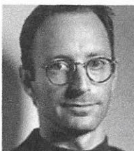
Herb Ritts, Photographer (8/13/52 – 12/26/2002)

After graduating from University High School in 1943, he attended USC where he was the NCAA 100 yard dash Champion in 1947, 1948 and 1949. At the same time, he set the world record in the 100 yard dash. In 1949, he broke Jesse Owens world record in the 220 yard dash. Mel Patton has been inducted into the National Track and Field Hall of Fame and the USC Sports Hall of Fame.