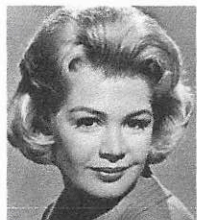
Sandra Dee 1958, Actress (4/23/42 – 2/20/2005)