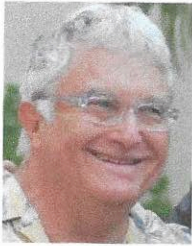
Randy Newman, Composer and Songwriter 11/28/1943)

Randall Stuart "Randy" Newman graduated from University High School and then studied music at UCLA. He began his recording career in 1968 with his first albums, Randy Newman , 12 Songs and Randy Newman Live . His songs have been covered by some of the biggest recording artists.