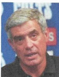
Jim Mora, Football (5/24/1935) 1953

Her early films in the 1950's included Asphalt Jungle , Niagara , Don't Bother to Knock and All About Eve . There were three films, Gentlemen Prefer Blondes , the Seven Year Itch , and How to Marry a Millionaire in 1953 that brought her to stardom. She quickly followed these films with a Golden Globe nomination for Best Actress in Bus Stop in 1956 and a Golden Globe Award for her performance in Some Like It Hot in 1959. Her last film was the Misfits in 1961 with Clark Gable.