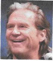
Jeff Bridges, Actor (12/4/1949) 1967

Jeffrey Leon Bridges was nominated for an Academy Award in Brave Heart , The Last Picture Show , Thunderbolt and Lightfoot , and Starman . He won an Academy Award for Best Actor in the film Crazy Heart . He has also made numerous other hit films during his career that has spanned fifty years.