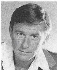
Roddy McDowall, Actor (9/17/1928 – 10/3/1998)

His work is a combination of genres including minimalism, rock and modernism. He has won an Obie, Musical America's Composer of the Year, and a Guggenheim Fellowship. He is also the founder of New York's "Bang on a Can," a music collective.