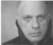
David Lang, Composer (1/8/1957) 1974

John Allan Jones became popular in the 1960's with songs such as Wives and Lovers , Lollipops and Roses and The Impossible Dream . He won a Grammy for Wives and Lovers and another for Lollipops and Roses . Jack Jones recorded over fifty albums during his career and still appears in concerts and Las Vegas.