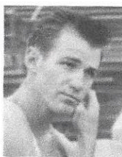
Mel Patton, Olympian (11/16/1924 – 5/19/2014) 1943

Melvin Emery "Mel" Patton won two Gold Medals in the 1948 Olympics in the 200 meters and the 4x100 relay.