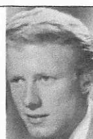
Dean Torrence, Vocalist (3/10/1940) 1958

Dean Ormsby Torrence attended Emerson Jr. High where he met William Jan Berry who would become his partner in the iconic vocal group of the 1970's, Jan and Dean. They both attended University High School and played on the football team. They put together their first vocal group, The Barons, at University High School in order to enter a talent contest. They graduated Unihl in the Vagabond Class of 1958.