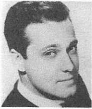
Jack Jones, Vocalist (1/14/1938)

John Allan Jones became popular in the 1960's with songs such as Wives and Lovers , Lollipops and Roses and The Impossible Dream . He won a Grammy for Wives and Lovers and another for Lollipops and Roses . Jack Jones recorded over fifty albums during his career and still appears in concerts and Las Vegas.