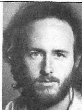
Robby Krieger, Guitarist and Songwriter (1/8/1946) 1964

John Paul Densmore played the drums in the marching band at University High School. He later attended Santa Monica City College and Cal State Northridge. He was a member of the Doors from 1965 until their dissolution in 1973. John Densmore has been inducted into the Rock and Roll Hall of Fame.