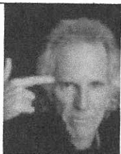
John Densmore, Drummer (12/1/1944) 1963

John Paul Densmore played the drums in the marching band at University High School. He later attended Santa Monica City College and Cal State Northridge. He was a member of the Doors from 1965 until their dissolution in 1973. John Densmore has been inducted into the Rock and Roll Hall of Fame.