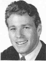
Ryan O'Neal, Actor (4/20/1941)

He is mainly known for his film scores which have earned him twenty Academy Award nominations and two Oscars for We Belong Together from Toy Story 3 in 2011 and in 2002 If I Don't Have You from Monster Inc. He has also won six Grammys and two Emmys for his compositions. He has been inducted into the Rock and Roll Hall of Fame, the Songwriters Hall of Fame and has a star on the Hollywood Walk of Fame.