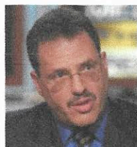
Larry Diamond, Political Sociologist (10/2/1951)