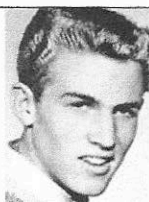
William Jan Berry, Vocalist (4/3/1941 - 3/26/2004) 1958

Jane Margaret Lakes was a United States Congresswoman from 1993 to 1999 and from 2001 to 2011. She is currently the CEO of the Woodrow Wilson Center for Scholars. She graduated from University High School in 1962 and attended Smith College and received her Law Degree from Harvard.