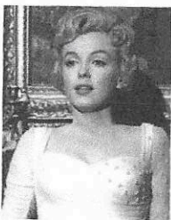
Marilyn Monroe, Actress (6/1/1926 - 8/5/1962)

Norma Jean Mortenson (Baker) is one of the most famous movie stars of all time and an American icon. T.V. Guide named her the number one film sex symbol of all time. The American Film institute named her the number six female actress of all time.