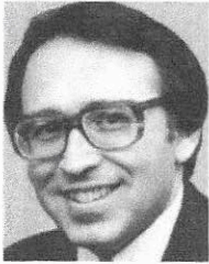
Howard Wolpe, United States Congressman (11/3/1939 – 10/25/2011) 1957

Howard Eliot Wolpe III graduated University High School. He was a Democrat elected to Congress in 1978 representing southwestern Michigan. As Chairman of the House Foreign Affairs Committee he played a key role in the passage of the Comprehensive Anti-Apartheid Act of 1986. He retired from Congress in 1992.